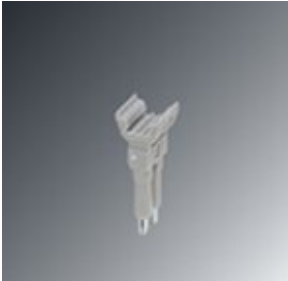
Plug-in bridge, pitch: 5.2 mm, number of positions: 2, color: red

Please be informed that the data shown in this PDF Document is generated from our Online Catalog. Please find the complete data in the user's documentation. Our General Terms of Use for Downloads are valid ( http://phoenixcontact.com/download )